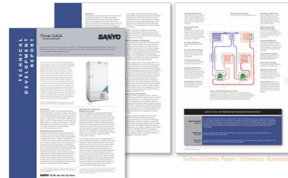
Technical White Paper / Schematic Illustration