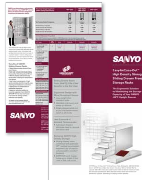
Product Literature / Brochure