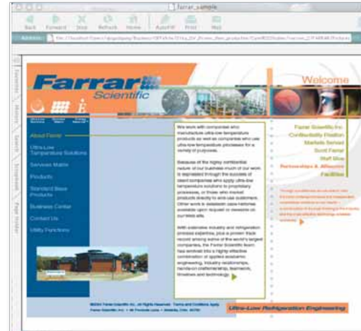
Web Site (design and architecture)