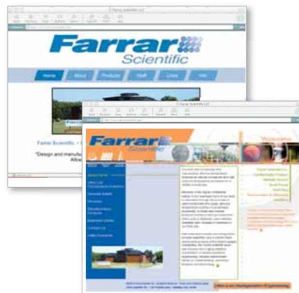
Web Site (old vs. new)