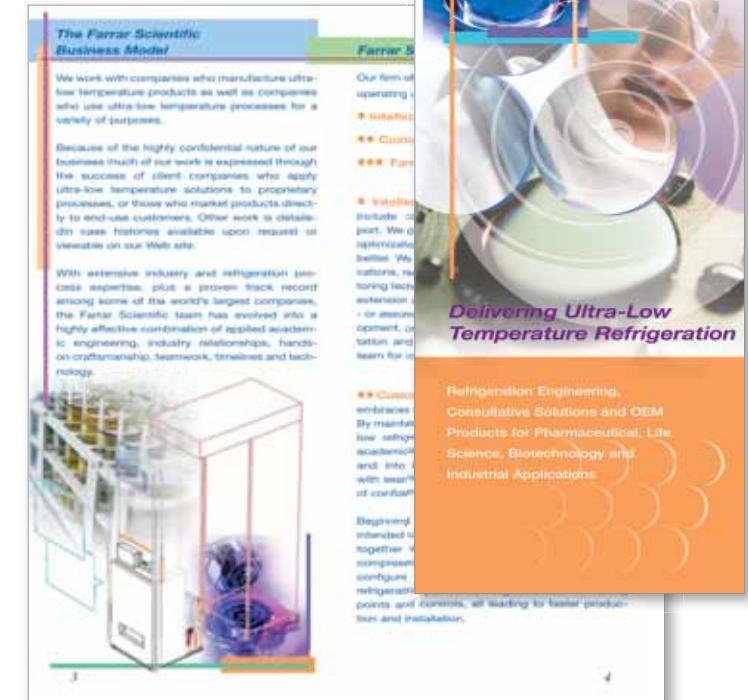
Viewbook (cover view) 4 x 9 inches, fits inside folder within designated slot. Also fits in #10 envelope.