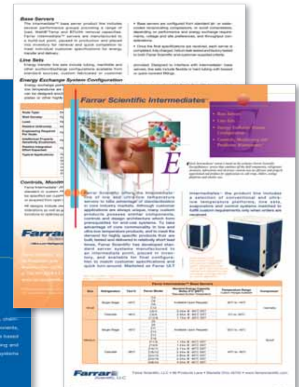
Product Literature Inserts