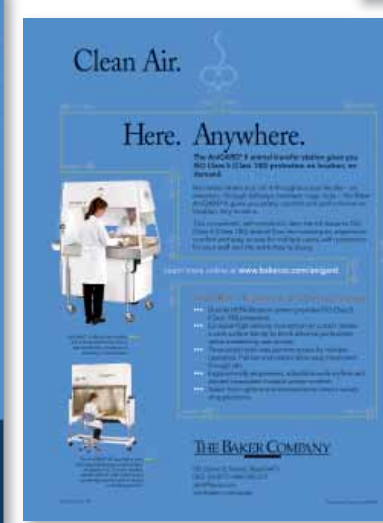
Campaign Print Ad