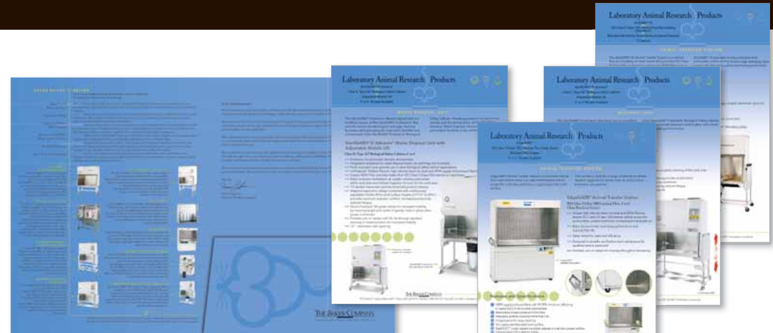
Presentation Folder (inside view)