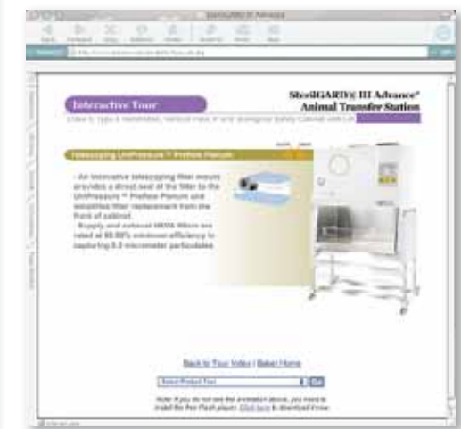
Web Site (interactive tour)